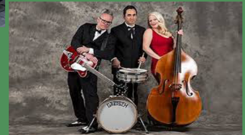
The Holy Rocka Rollaz-4 p.m.

Car Show & TC Cats Music Living Faith Church 10101 Lexington Ave N 9 a.m.-2 p.m.