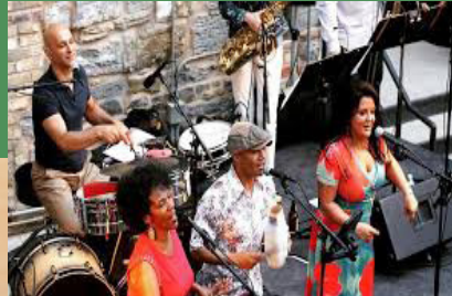
Salsa del Soul Sextet 2 p.m.